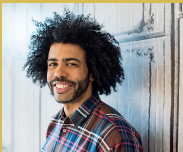
Daveed Diggs

Jewish American Reading List from the BUSD Library