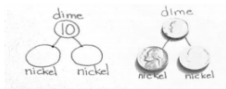
Number bonds with coins

In this final module of the school year, students synthesize their learning from all the other modules, working with the most challenging Grade 1 content. In the first several lessons, students identify and solve various types of word problems. Next, they extend their skills with tens and ones to numbers to 120, both counting and performing addition and subtraction. Finally, they are introduced to nickels and quarters, having already worked with dimes and pennies. The module concludes with fun fluency activities to celebrate their year of mathematical learning.