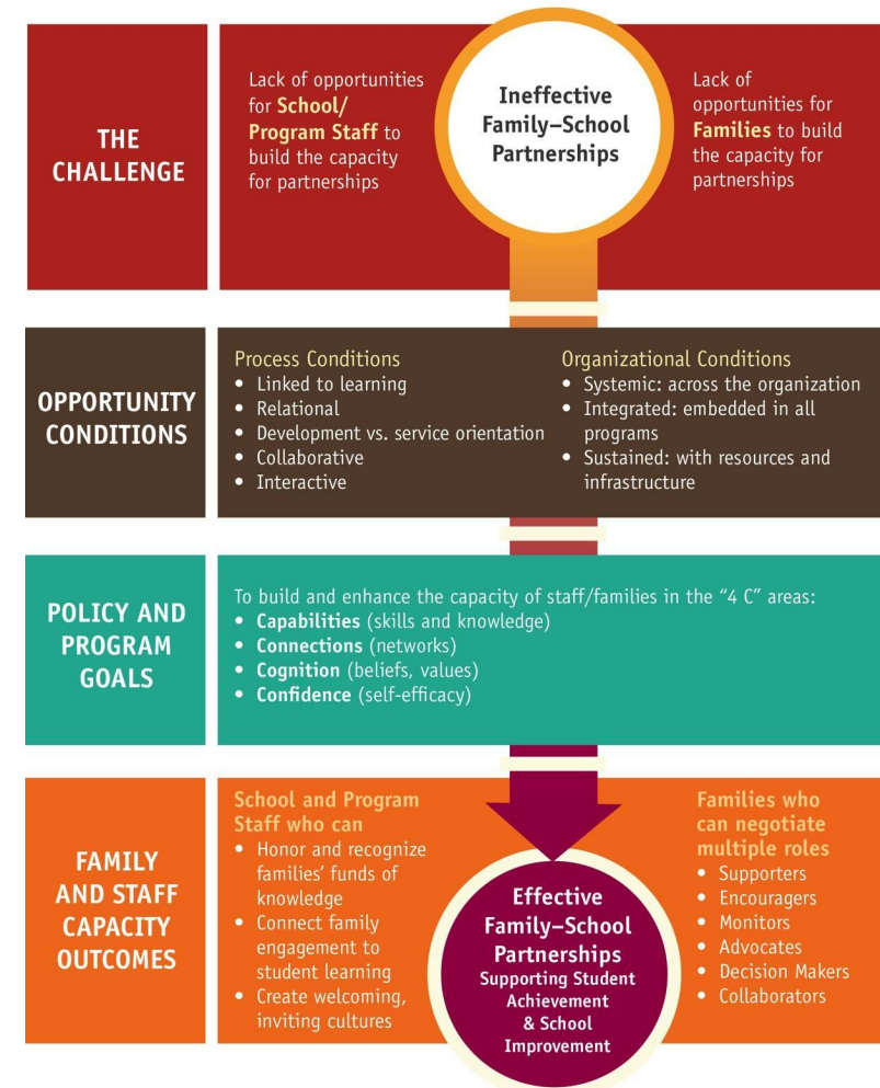
The Dual Capacity-Building Framework for Family-School Partnerships