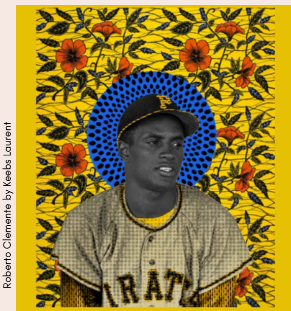
Roberto Clemente