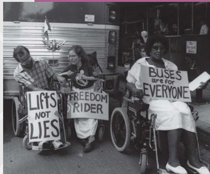
Disability Rights Movement Protest for the Rehabilitation Act, 1973