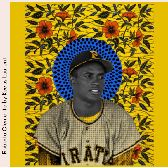
Roberto Clemente