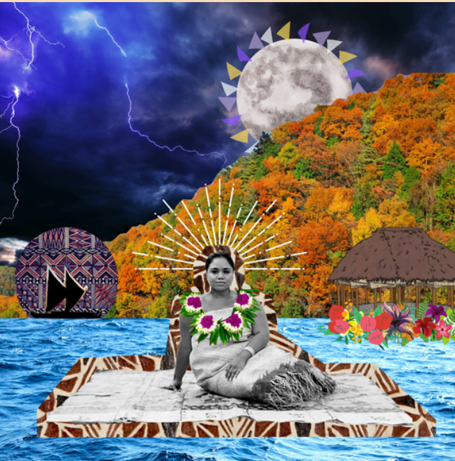
A collage image of poet, Terisa Siagatonu